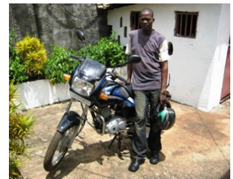
Project Administrator - CAPS

Work plan from June to August 2011 is being prepared, which is designed as a road map to ensure effective sensitisation.